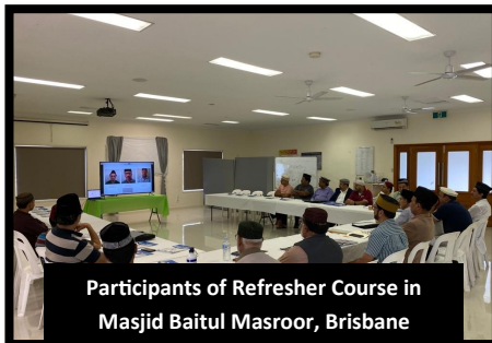
Participants of Refresher Course in Masjid Baitul Masroor, Brisbane