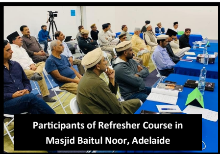
Participants of Refresher Course in Masjid Baitul Noor, Adelaide