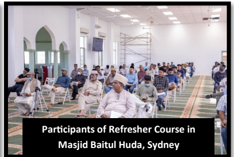
Participants of Refresher Course in Masjid Baitul Huda, Sydney